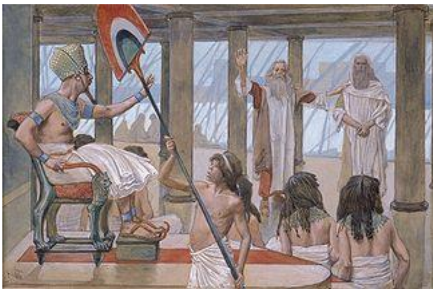
Moses Speaks to Pharaoh (watercolor circa 1896–1902 by James Tissot)

Where we left off in last week’s Torah portion, Moses and his brother, Aaron, had approached Pharaoh to demand the release of God’s people. Not only did the King of Egypt refuse, but he made it even worse for the Israelites by demanding that they find their own straw (whereas previously it had been provided for them); while still demanding them to produce the same quota of bricks. The children of Israel complained to Moses; whereby he went directly to God to find out ‘ what gives ’? God gave Moses His assurance that He would, once and for all, deal with Pharaoh and the Egyptians.