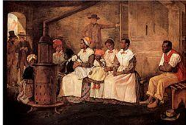
Slaves Waiting for Sale: Richmond, Virginia. Painted upon the sketch of 1853

The African – American people, in their struggle to be set free from the cruel system of slavery that they suffered under in the United States could easily identify with the Israelites and Moses. The Black people of America also cried out to God for deliverance and sang songs of hoped for freedom and liberation: “ Go down Moses, way down to Egypt’s land, tell o Pharaoh, let my people go! ”