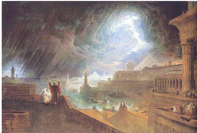
The Seventh Plague (1823 painting by John Martin)

“Only in the land of Goshen, where the children of Israel were, was there no hail.” (Exodus 9:26)