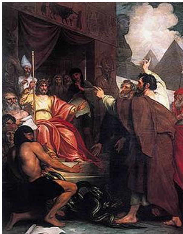
Moses and Aaron before Pharaoh (painting by Benjamin West)

God’s purpose in the plagues was twofold: To reveal Himself as Adonai to the Egyptians and to bring His people Israel out of Egypt. “And the Egyptians shall know that I am the Lord, when I stretch forth My hand upon Egypt and bring out the children of Israel from among them.” (Exodus 7:5)